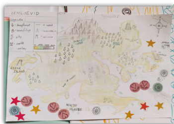
Student design (SLO)

One of the most exciting happenings of the last few months in the me_HeLi-D project has been the realization of the various student ideas from the design workshops (June 2023) by the amazing Slovenian designer Monika Klobčar . After many months of sketching and iterating, the designs were finalized and digitalized. Great care was taken to ensure that they closely followed the students' original ideas, but also resulted in a well-rounded and coherent overall design. Two examples of how the Landscape of a Mind and the buddy character HeLi, the Crow , were realized are shown below.